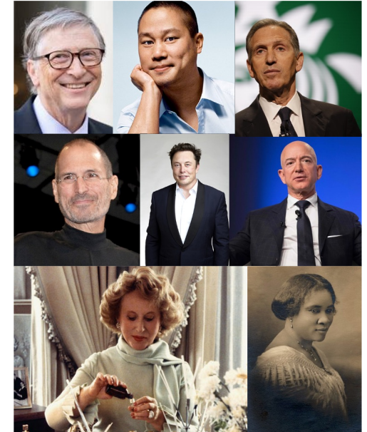
From top-left: Bill Gates, Tony Hsieh, Howard Schultz, Steve Jobs, Elon Musk, Jeff Bezos, Estee Lauder, Madame C. J. Walker.